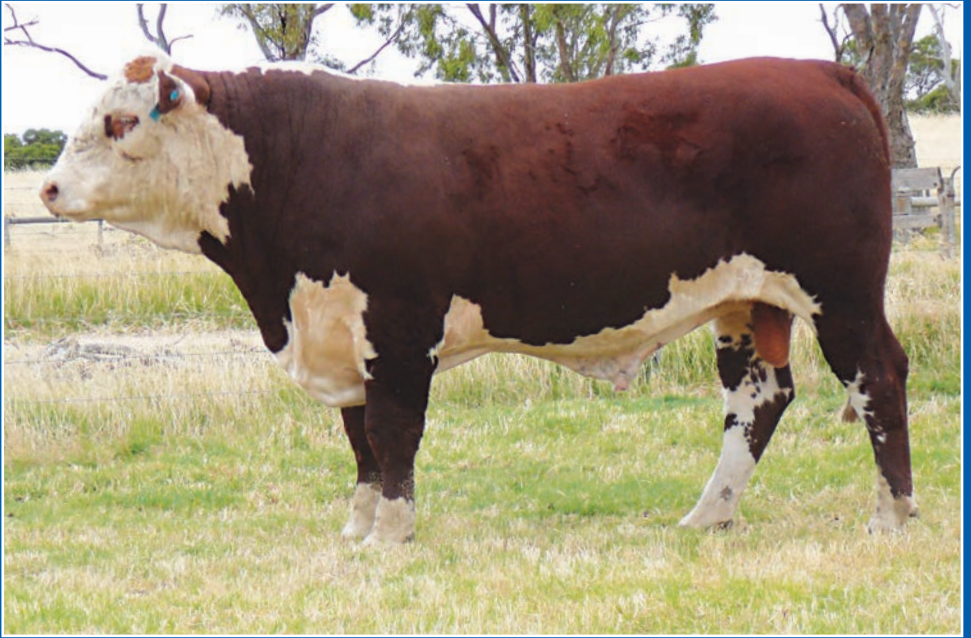
LOT 7 MORGANVALE LINDEN (P) WLM L011FV