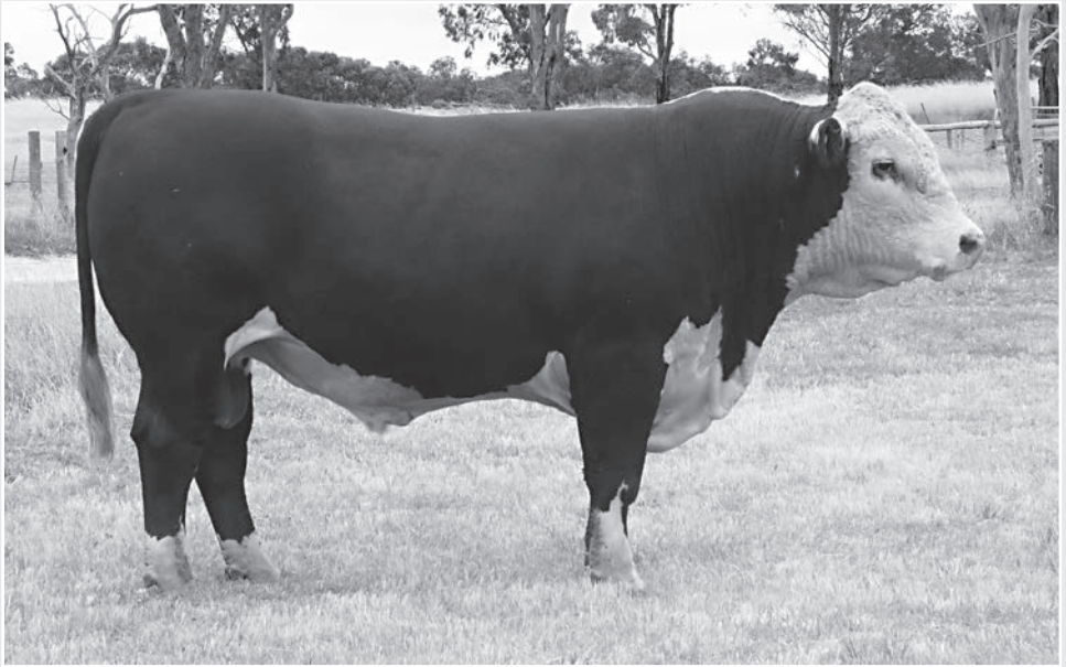
LOT 10 MORGANVALE LIMA (P) WLM L136