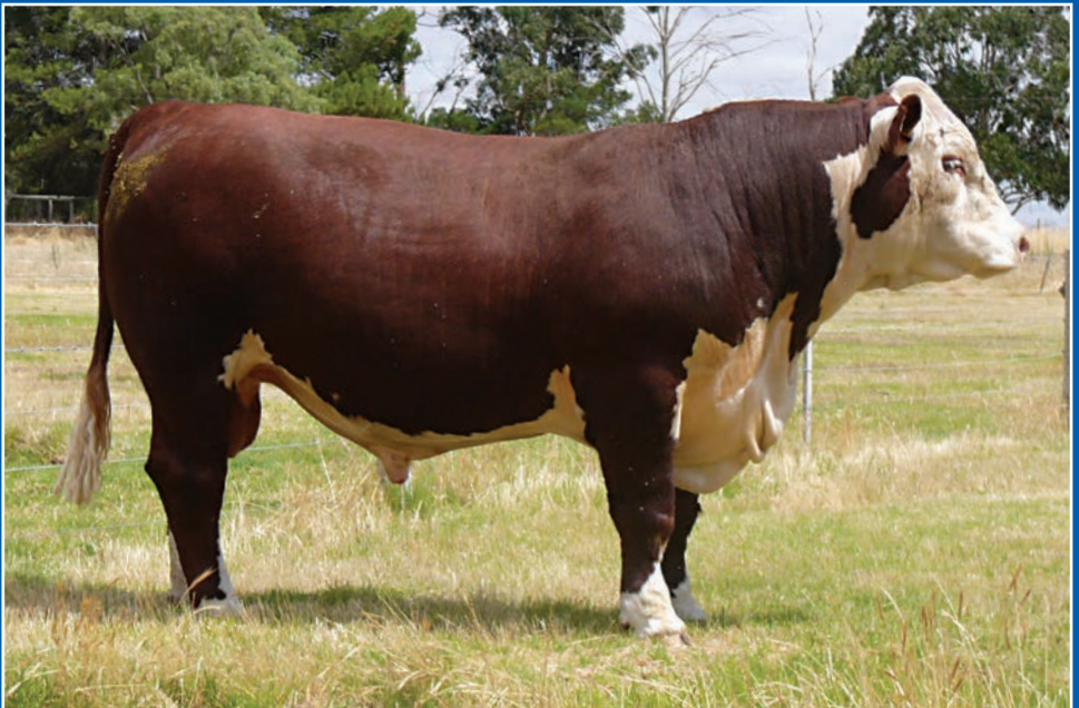
LOT 2 MORGANVALE LACEY (P) WLM L168