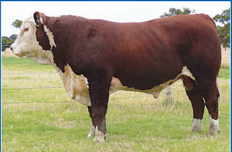
LOT 6 MORGANVALE LACHLAN (P) WLM L152