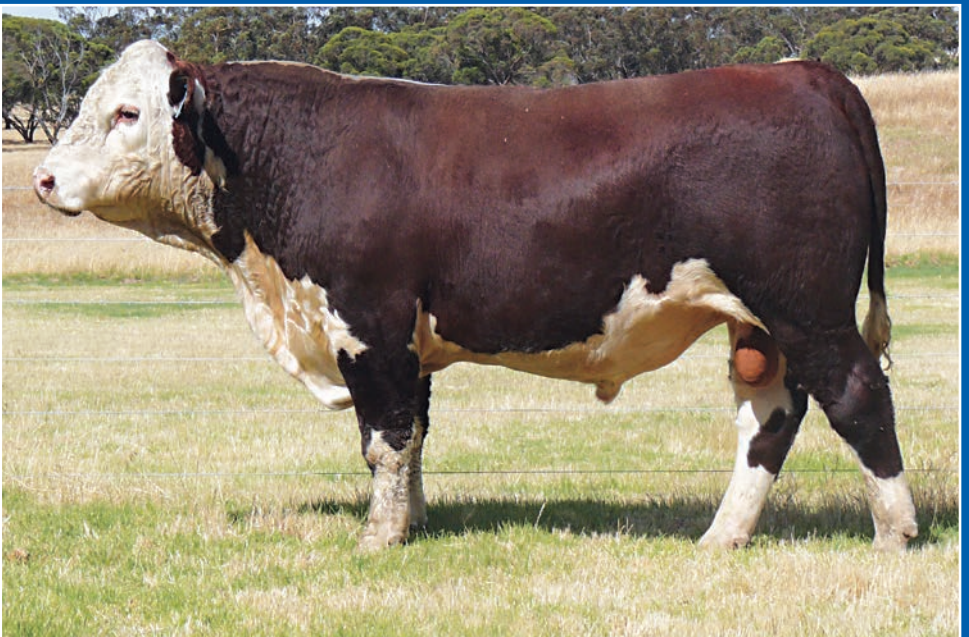
LOT 26 MORGANVALE LEGHORN (P) WLM L082