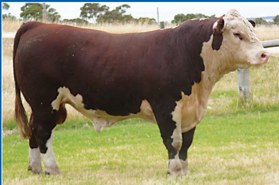
LOT 12 MORGANVALE LUCIFER (P) WLM L248