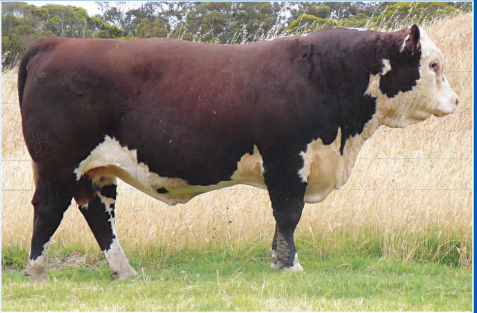
LOT 13 MORGANVALE LYCHEE (P) WLM L226