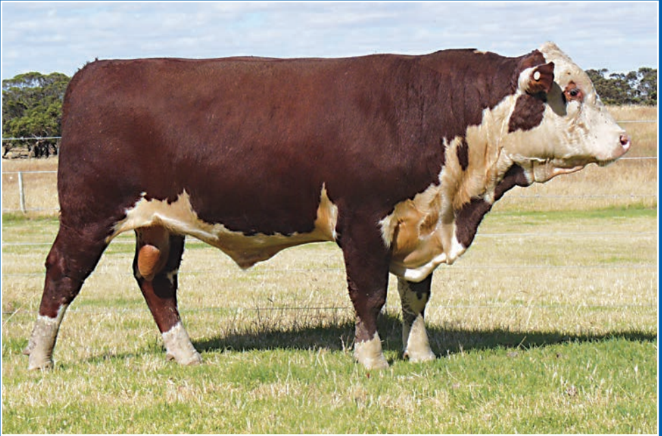
LOT 28 MORGANVALE LOTTERY (P) WLM L186