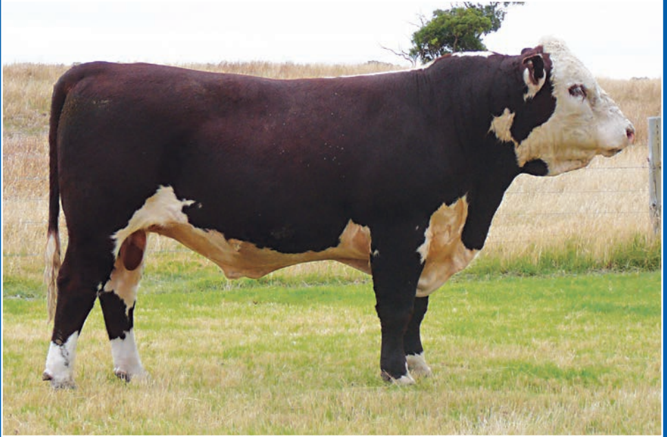
LOT 1 MORGANVALE LATIMER (P) WLM L162