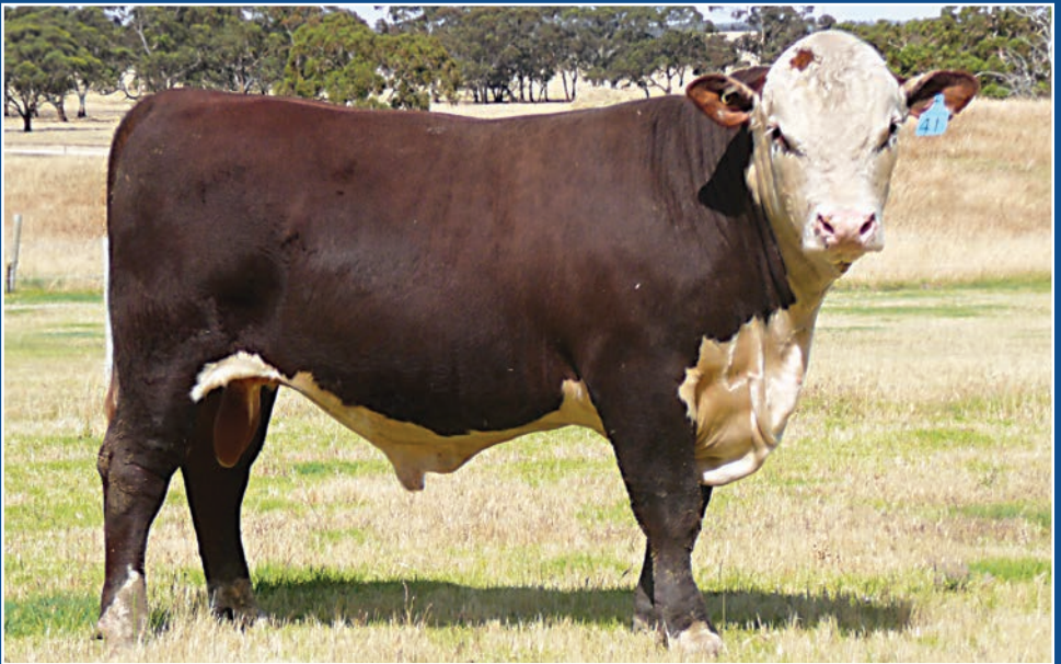
LOT 41 MORGANVALE LIMERICK (P) WLM L318