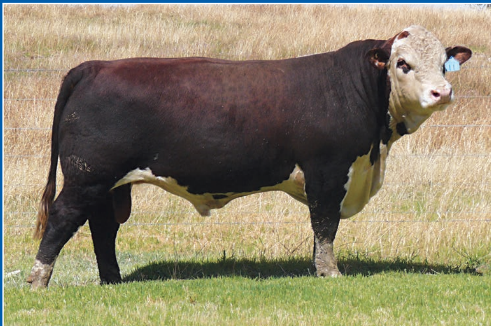
LOT 11 MORGANVALE LUSTRE (P) WLM L213