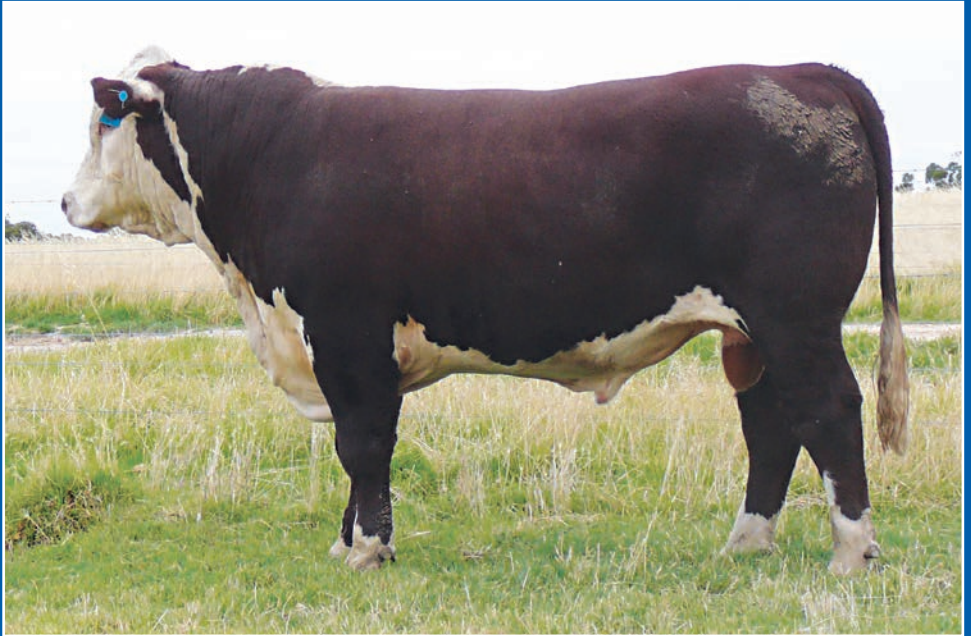
LOT 3 MORGANVALE LANDON (P) WLM L092