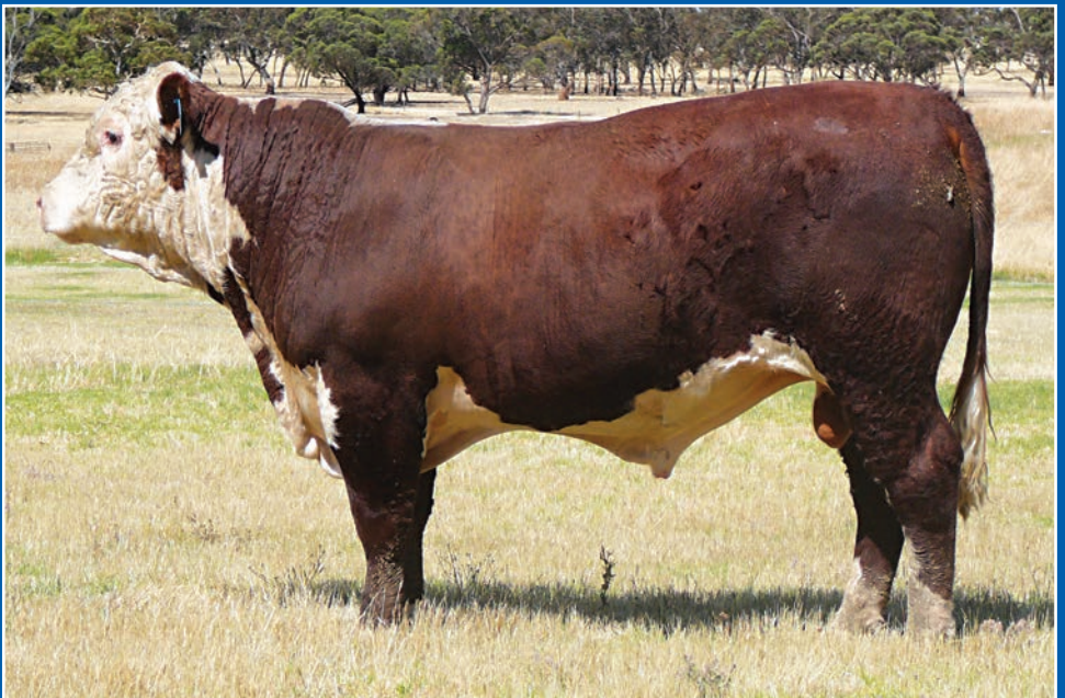
LOT 9 MORGANVALE LITHIUM (P) WLM L055