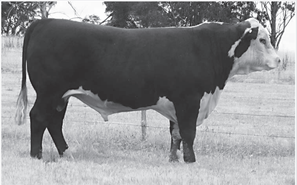
LOT 27 MORGANVALE LAMONT (P) WLM L141