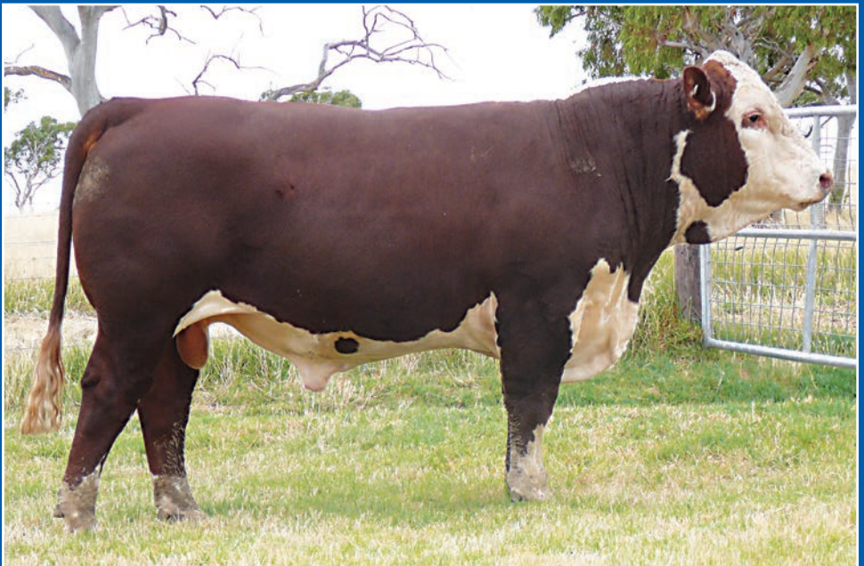
LOT 40 MORGANVALE LOGIC (P) WLM L295