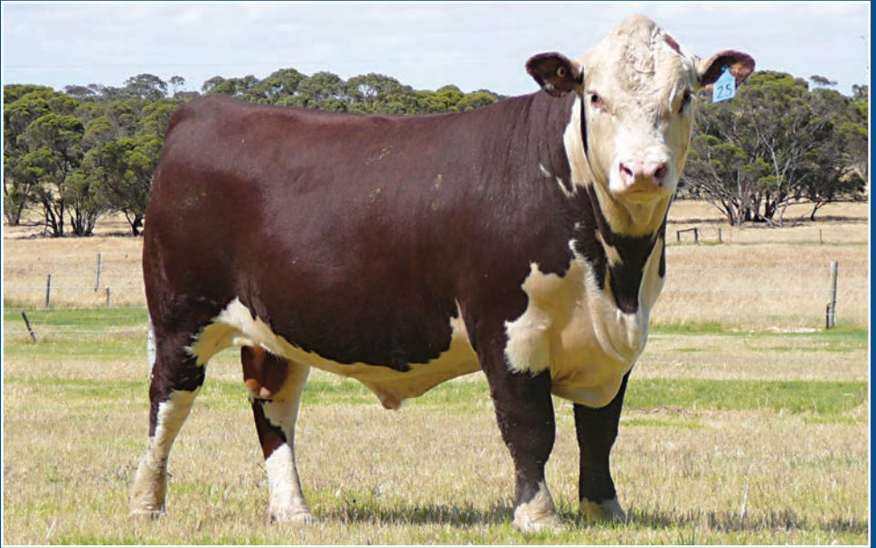
LOT 25 MORGANVALE LEROY (P) WLM L145